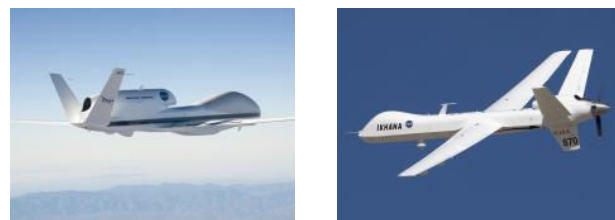
Figure 3 – Global Hawk (left) and Ikhana (right) UAS.

NASA's Dryden Flight Research Center has acquired three developmental-model Northrop Grumman Global Hawk unmanned aircraft from the U.S. Air Force for use in high-altitude, long-duration Earth science missions. These autonomously flown aircraft are the first, sixth and seventh aircraft built under the original Global Hawk Advanced Concept Technology Demonstrator development program sponsored by the Defense Advanced Research Projects Agency.