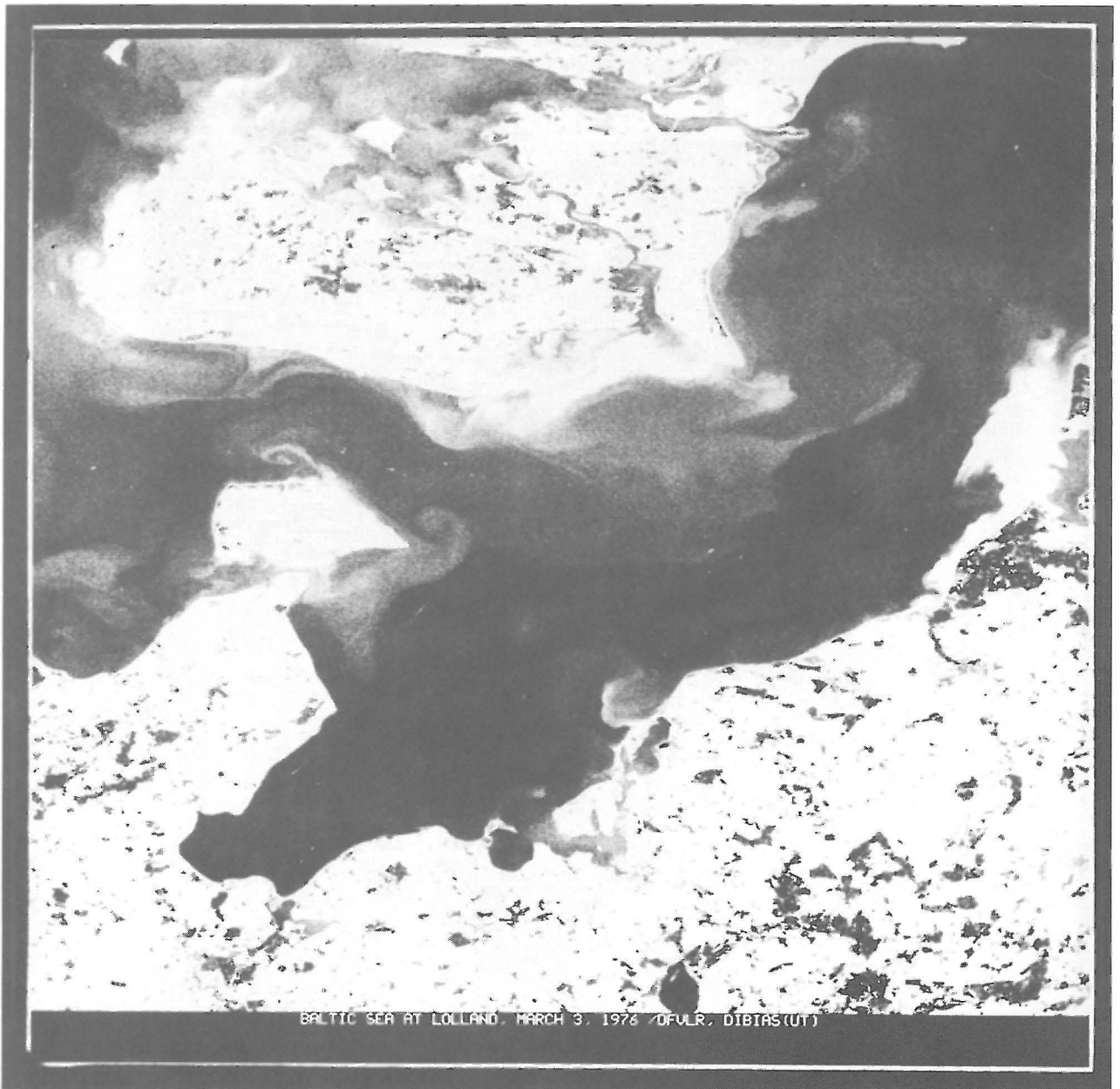
Fig. 1: MSS 4 version of LANDSAT scene of March 3rd, 1976, of southwestern Baltic sea, showing the beginning of a phytoplankton spring bloom.