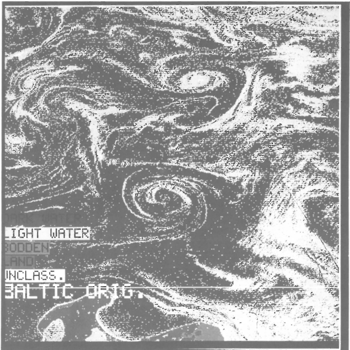
Fig. 5: Area of Fig. 4 after application of maximum likelihood classification, (using four different training areas) for determination of coverage of the algae (black and white rendition of colour coded original).