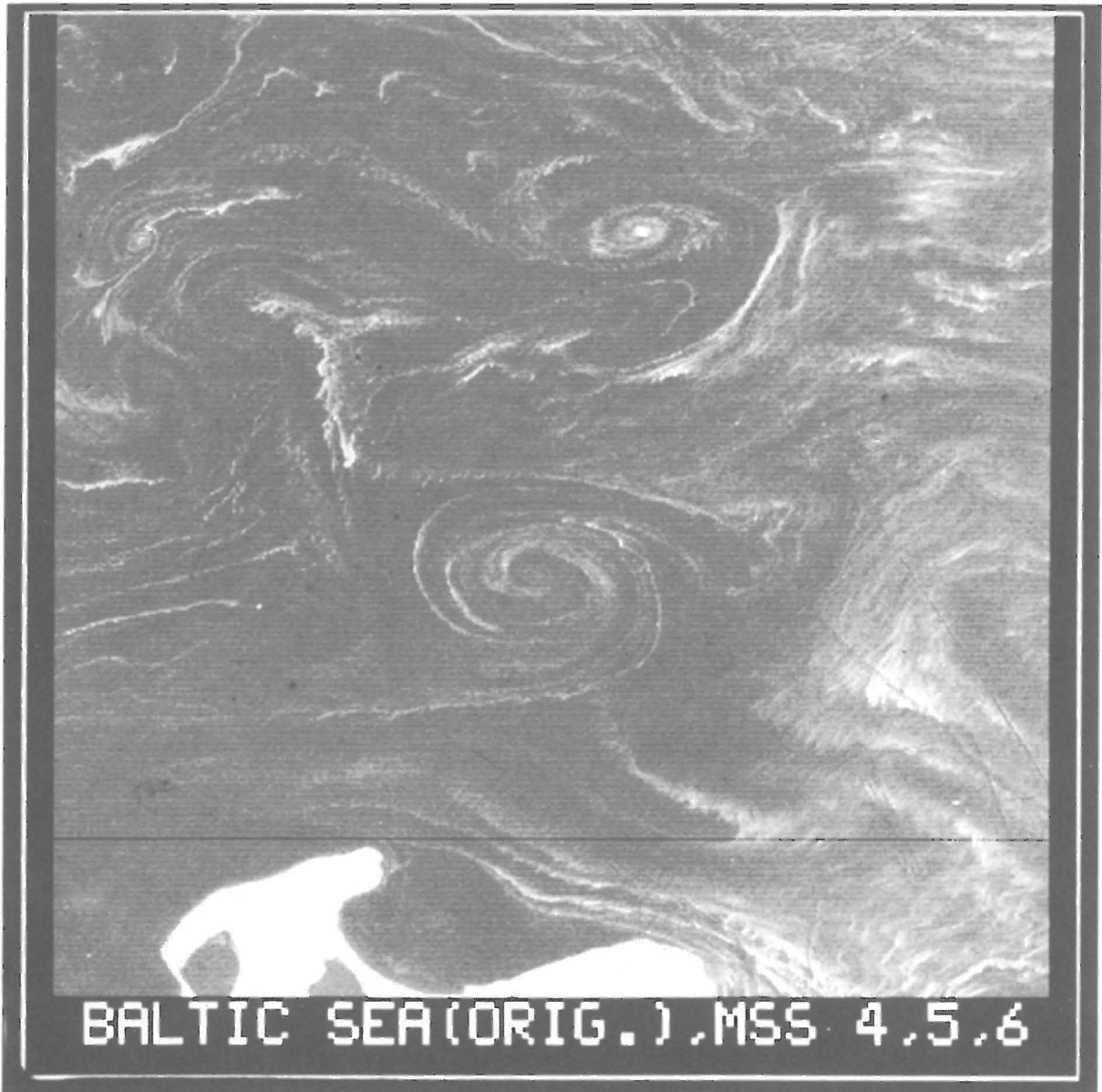
Fig. 4: Black and white rendition of colour coded MSS 4,5 and 6, version of test area in the Baltic sea, depicting eddies traced through blue-green algae in the upper layer of the water.