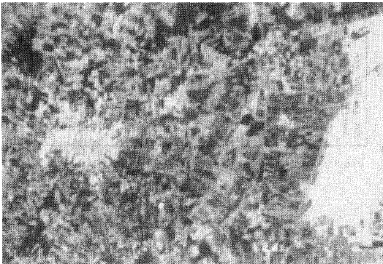
Fig.5 : Landsat TM image (band 3) of the town El Minya in 1985.