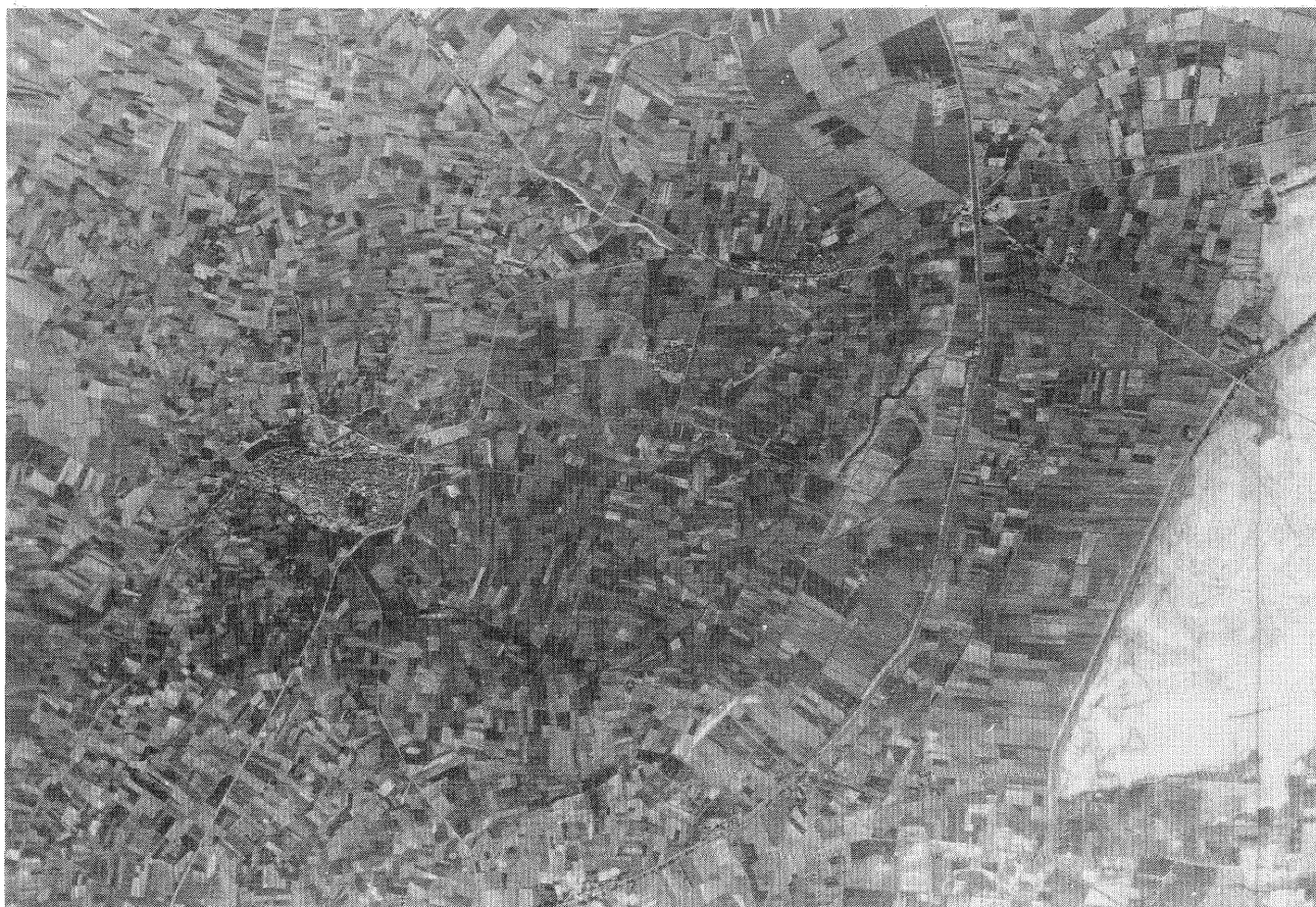
Fig.4 : Aerial photograph of the town El Minya in 1956.