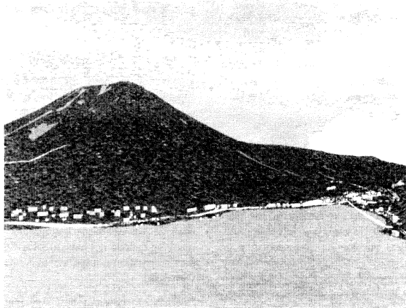
Figure 2 Landscape of Lake Chuzenji-ko and Mt.Nantai-san