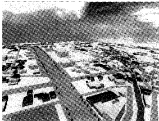
Figure 1 Landscape of Fuji City

Takahashi, H., et al., 1995. A new approach of map representation for realistic expression of three dimensional space. In:17th International Cartographic Conference, Proceedings 1, pp.640-643.