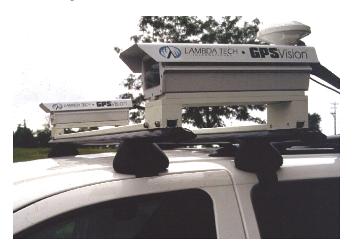
Fig. 1 Portable GPSVision system consists of GPS, INS and Digital Cameras

The GPSVision is a very flexible system and many different types of GPS receivers or cameras are also used depending on the application requirement. The other important feature of the GPSVision is its independence with the moving platform. It is portable and can be mounted on different vehicles. Fig. 1 shows the GPS receiver, the camera pads and the INS system which is inside the left pad.