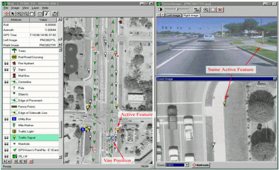
Fig. 5 The GPSVision data overlaid on the aerial photography. This provides the view of the infrastructure both from the ground and in the air. It is used for engineering design.

To better serve the user's needs, a study was conducted to combine the GPSVision data and the digital aerial photographs. The main idea is to use the GPSVision to measure feature along the road and then use them as controls to rectify digital aerial images. The aerial images are then served as the background images and also used to digitize the features far away from roads. All of the rectified aerial images are mosaiced and tiled in small images for easy display and handling .