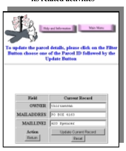
Figure 5: Title and Valuation Updating on the World Wide

The three distinctive components within the VLIS portal resemble closely the three-tier COM model adopted by the Open GIS and the AWWWM Consortiums (Open GIS Consortium 2000). Consequently, VLIS inherits issues that affect the performance of the three components. Through the development of VLIS, it was noted that the issues are component specific and are listed as follows: