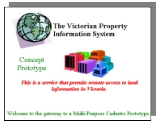
Figure 3: Login screen and gateway to the prototype prototype