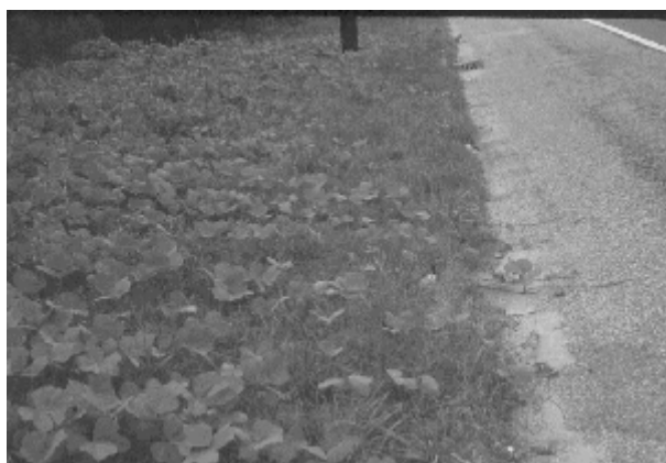
Kudzu growth, South East USA

Approximately 4,000 species of exotic plants (Kartesz and Morse 1997) have established free-living populations in the United States. Nearly seven hundred are known to cause severe harm to agriculture at a cost of billions of dollars annually. Four hundred exotic plant species have been identified as a threat to our native flora and fauna as a result of their aggressive, invasive characteristics. Invasive plants reproduce rapidly, either vegetatively or by seed. Their phenomenal growth allows them to overwhelm and displace existing vegetation and form dense one-species stands.