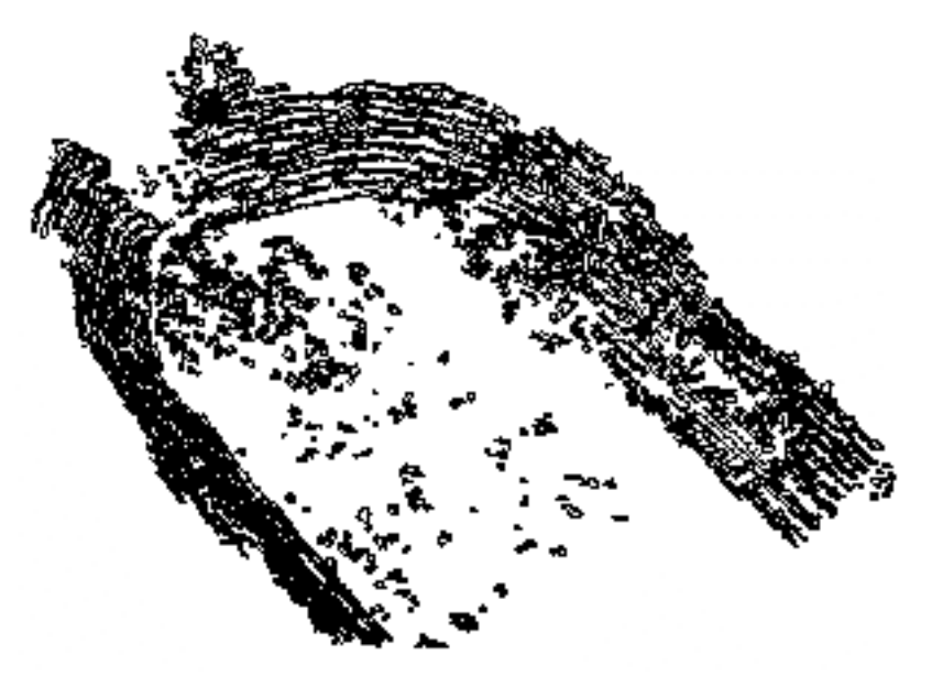
Fig. 2 Detail of the ruins, 3D-view from the SW