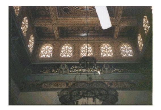
Figure (1) Part of the panel

A part of the ceiling of Abdel-Raheem El-Kenawi's mosque has been chosen as a test field for this investigation. Its flat ceiling and its domes has a very beautiful decoration which has been painted by the Islamic artists. The test field consists of one panel of the whole ceiling which contains a dome centered in its flat ceiling. The diameter of the dome is about five meter and the dimension of the flat ceiling is about 8 x 8 meters. It surrounded by a system of regular columns which carry a sold part decorated with a beautiful painting and calligraphy. Above the sold part, there are a row of windows covered with regular Islamic pattern . Theses windows separates by painted posts which carry the flat ceiling and the dome. Figure (1) shows part of the panel.