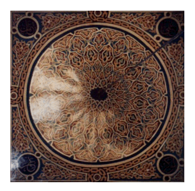
Figure (5) An orthoimage of the test field

An orthoimage related to the flat ceiling plan as a reference plan has been obtain directly from the used photogrammetric software as shown in figure (5). This image has been divided into four quadrant for purposes of the geometric comparison. Each quadrant has been enhanced through an image enhancement software to prepare the images for the comparison. The upper-left quadrant is remain as it is, the upper-right quadrant has been flipped horizontally, the lower-left quadrant has been flipped vertically and the lower-right quadrant has been flipped vertically. Figure (6) shows the various quadrates.