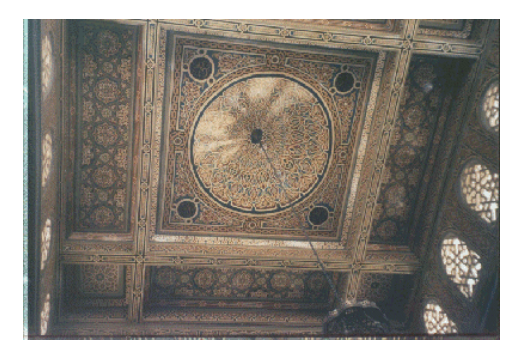
Figure (3) An original Image