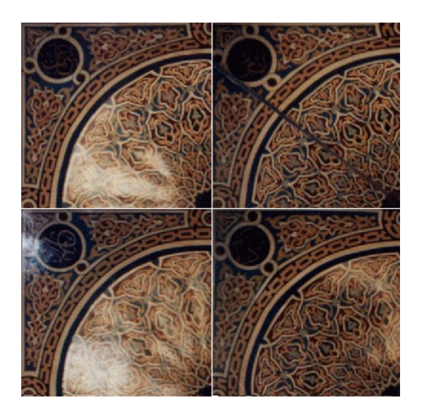
Figure (6) The orthoimage four quadrate

In the enhanced image which illustrated in figure (6), 28 points have been chosen and their co-ordinates have been measured in each quadrant. The image co-ordinates have been transformed from pixels to meter by multiplying each co-ordinate by the transformation factor. This factor is equal to 0.01056 which has been calculate from the distance between two points in the original orthoimage by pixel and its equivalent length by meter. The lengths between each point and the others (378 lengths) in each quadrant have been calculated. The lengths range is between .144 and 3.274 meter. A comparison between the calculated lengths in the various quadrant has been done. This comparison shows that the average standard deviation of the lengths is .0353 meter. For purposes of the geometric comparison, two models