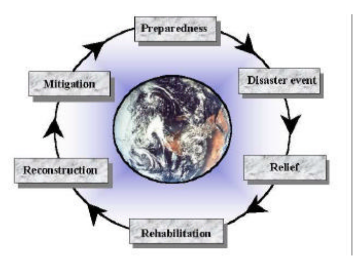
Figure 2: The Disaster Management cycle