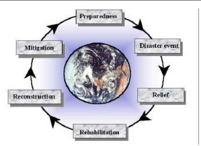
Figure 2: The Disaster Management cycle