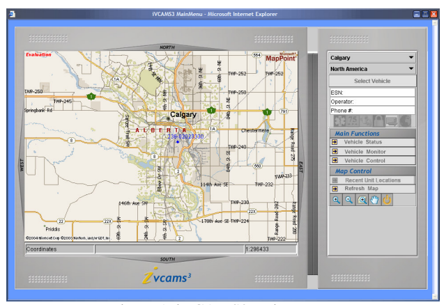
Figure 1. iVCAMS3 main screen

A prototype system, named as iVCAMS3 (Internet-based Vehicle Control And Monitoring System for Safety and Security), has been developed using the development platform at The University of Calgary to monitor and control vehicles for safety and security purposes. The main screen can be seen in the following figure.