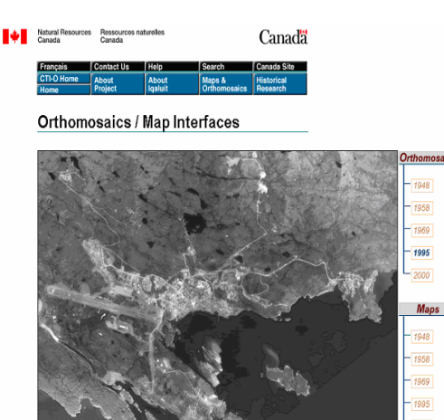
See an example of a map overlaying orthomosaic (for the year 2000)

and records provided additional information to reconstruct the development of Jqaluit to discover the factors influencing change, explain patterns in development of the city, and provide a cultural and social background. Figure 3 shows the user interface created to display historical orthomosaics, maps, photographs and 3D renderings of the terrain in the form of animations.