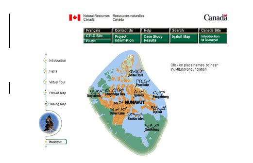
Figure 1. Audio-visual place name map of Nunavut.

The multimedia and multimodal technologies that engage other senses, such as hearing and touching are more effective in communicating information to users than simple graphics. The use of sounds lends itself well to the map of <u>Nunavut</u>. When the user clicks on a place name, the name of the place is spoken in <u>Inuktituk</u>, a <u>native</u> language of northern Canada. Figure 1 shows the audio-visual map of settlements in Nunavut. The voice files have been recorded to assure the correct pronunciation of place names. This created relatively large digital files thus for the general voice application it is preferable to work with text based voice generation.