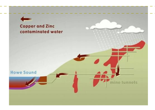
Figure 4. Passive animation from Canada Rover.

Modelling Language (VRML) for a more realistic representation of terrain data (Hedley, 2003).