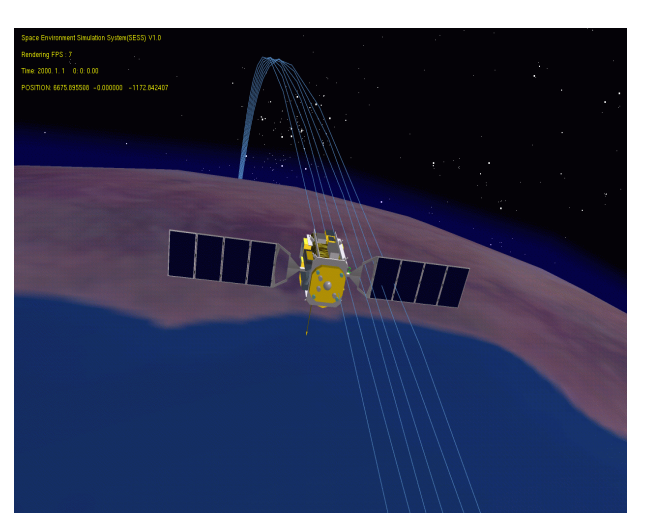
Figure1 three-dimension visualization about the space

In GIS, spatial analysis is the space data analysis technology based on the position and configuration property of the