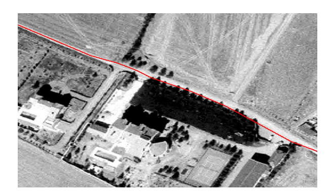
Figure 2. Road extraction based on edge and correlation analyses

Figure 2 shows the results of the road extraction based on edge and correlation analyses. The extracted road is shown in red. The visual interpretation of results reveals that the method works satisfactorily on most parts of the road. This method has some problems where the road width changes too much,