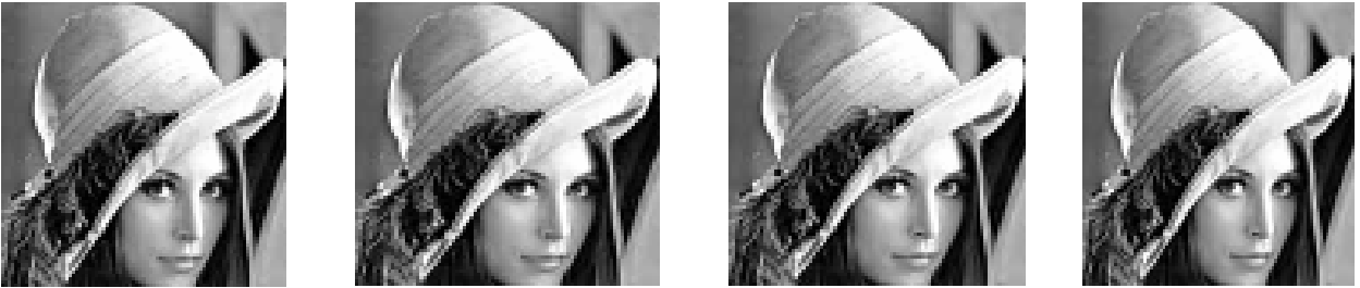
Figure 2. Four simulated Lena low-resolution images

Firstly, RG algorithm was used to enhance a high-resolution image using the known sub-pixel shifts. The result is shown in figure 3(a). In order to demonstrate the performance of the proposed matching-error-considered algorithm, it is assumed that the estimation of the sub-pixel shifts is incorrect as \{(0.0,0.0), (0.15,0.35), (0.35,0.15), (0.35,0.35)\} , and the RG algorithm and the proposed algorithm are used to solve the solution respectively. The results are shown in Figure 3(b) and Figure 3(c). The results visually show that our proposed algorithm yields better performance. Figure 3(b) has more artifacts because the matching error isn't considered. However, Figure 3(c) has little difference from Figure 3(a), which enhanced using correct sub-pixel shifts. So the proposed algorithm can lower the effect of the matching error effectively.