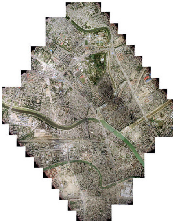
Figure 3. A mosaic of 5 \times 10 orthoimages of the Tianjin Haihe river project.