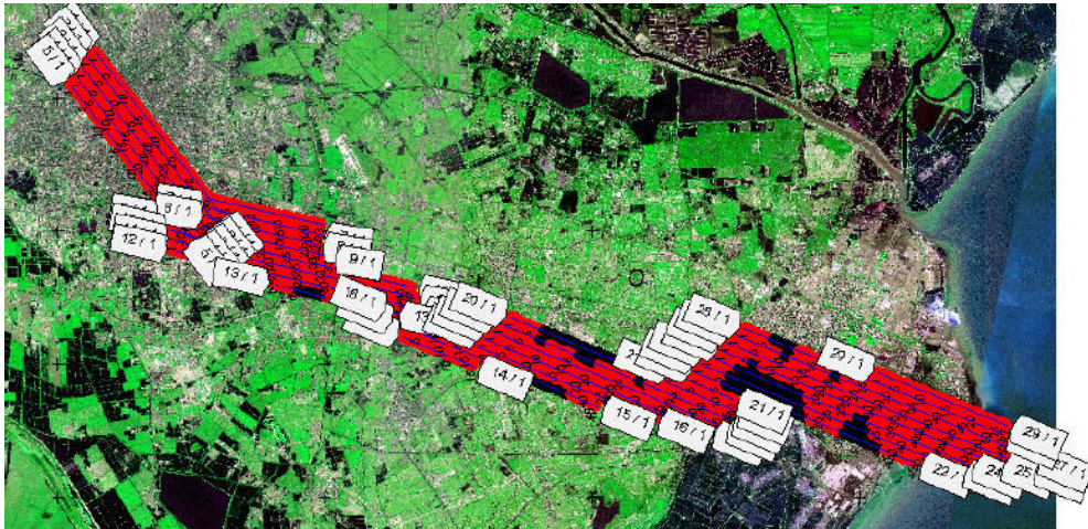
Figure 2. Mission planning of the Tianjin Haihe river project.

June 15, 16, 25 and 26, 2003, respectively. After direct georeferencing of aerial imagery orthoimages of the first two flights were generated. Figure 2 shows the mission planning results of the project. A mosaic of 5 \times 10 orthoimages is shown in Figure 3.