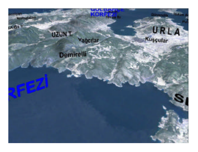
Figure 4. Perspective view with the settlement names.

3D visualization was produced in Erdas Virtual GIS module. Road and railway network, city boundaries, names of the cities, towns, rivers, lakes and dams (Figure 4).