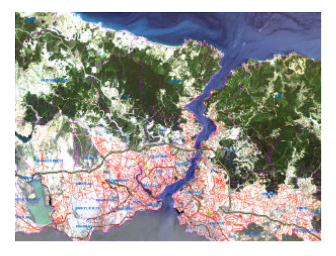
Figure 5. Vectors over Landsat orthoimagery

Also with a program produced in Photogrammetry Department of GCM, it is possible to superimpose location names and some other vector data on to the orthophotos (Figure 5).