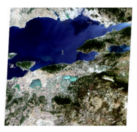
Figure 1. LANDSAT Imagery of Marmara Sea (Bands 3,2,1)

An example of the combination of 3,2,1 bands were given in Figure 1.