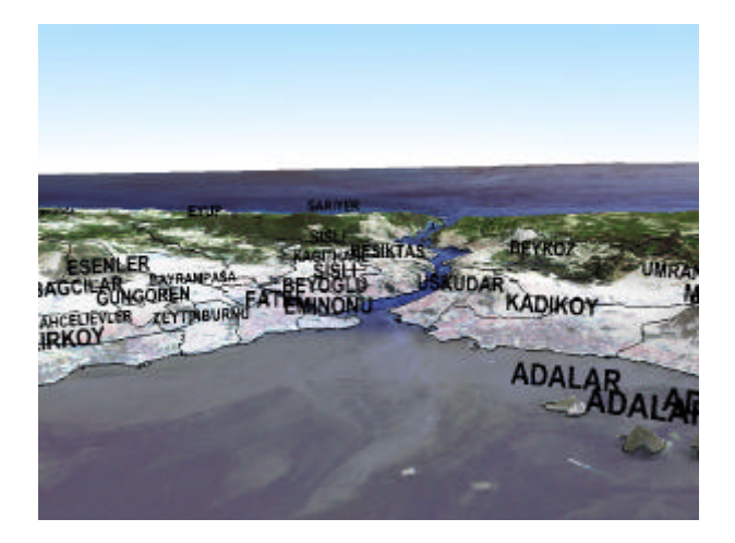
Figure 6. Panoramic view of Istanbul

The panoramic view of the same area is shown in the Figure 6.