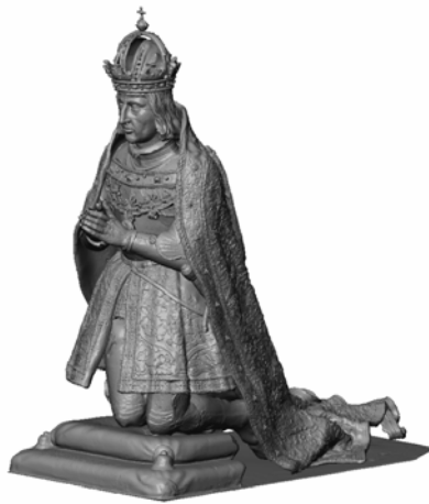
Fig. 2: Kneeling Maximilian I. Virtual model from scanned data.

A photogrammetric documentation of the whole object was carried out by a private surveying company experienced in the documentation of cultural heritage. A Zeiss UMK metric camera was used. In addition, stereo images were acquired for each relief on high resolution b/w film. Also, orthogonal images were exposed on color film for later rectification and/or texturing.