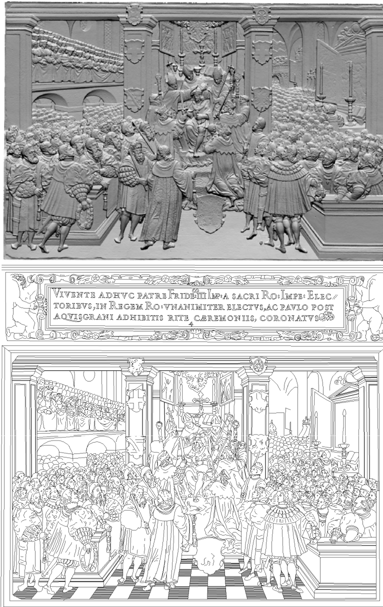
Fig. 3: One of the relief plates. Top: Virtual model from scanned data. Bottom: Result of stereo plotting