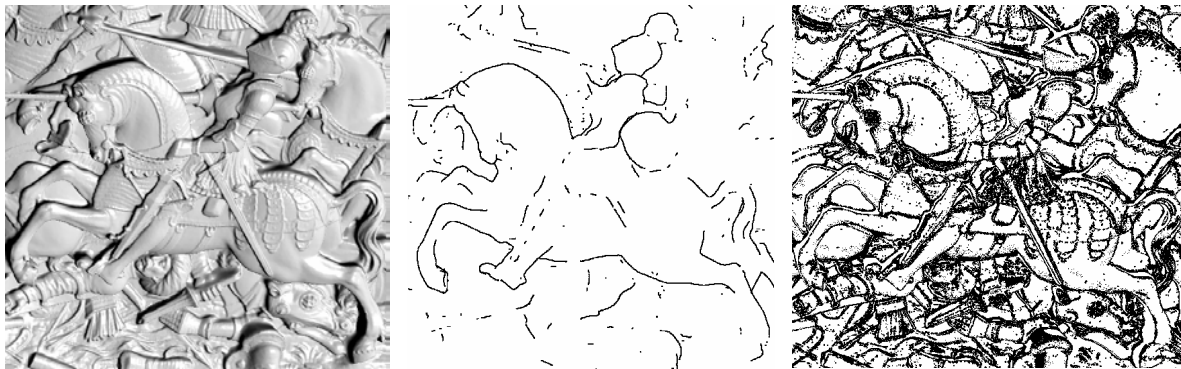
Fig. 6: Left: Part of a virtual relief model. Center: Automatically detected outlines. Right: Automatically detected edges; unfortunately, the red and green colors (for concave and convex edges) cannot be shown in this black-and-white print.

The software developed at i3mainz computes the normals for all triangles of a mesh. For every triangle, the spatial angles to the three neighboring triangle normals are identified and a weighted mean value is computed. Positive (convex) and negative (concave) values can occur. Then, a histogram of all values is produced. Based on this, the user can define a number of classes for local curvature and select intensity values (green for convex, red for concave) which are used to shade the triangles concerned. This can easily be accomplished if the OBJ format is used for the mesh. Since shaded triangles are used, the result is not a true vector plan. This is not a real problem since – for the reasons mentioned above - the result cannot be used as a final drawing anyhow. Instead, it is used together with the plan of the outlines as a background for the creation of the final vector product.