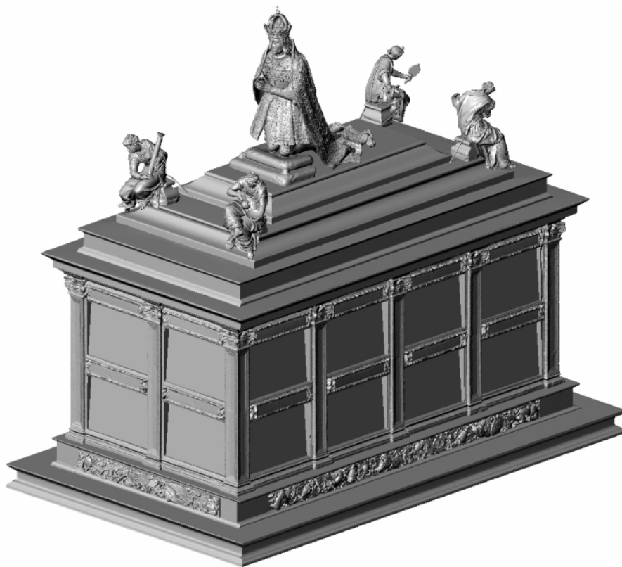
Fig. 1: Overview model of the cenotaph derived from scanned data

Both, close-range photogrammetry and 3D scanning techniques were used. Photogrammetric images consisted of stereo pairs and separate color images. 3D scanning was accomplished with a MENSIS S25 laser scanner for the overall structures and a GOM ATOS II structured light scanner at high resolution for the relief plates.