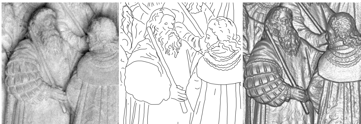
Fig. 4: Detail from relief plate above (fig. 3), about 10 cm x 10 cm in reality. Left: Photograph. Center: Result of stereo plotting. Right: Virtual model from scanned data.