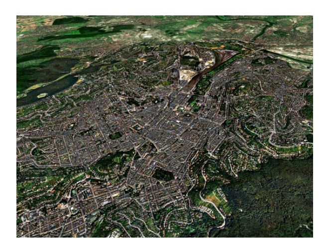
Figure 7. Overview of a visualisation of the city of Stuttgart using Open Scene Graph and libMini.

Within the scope of the project GISMO, an application for the real-time visualisation of large-scale urban landscape models has been realised that is based on Open Scene Graph and libMini libraries (Kada et al., 2003). The aim of the project was to generate and interactively visualise the city of Stuttgart, Germany. With respect to the desired flexibility to support walkthrough and flyover applications, a combined approach using continuous level-of-detail and the impostor technique was used to speed up the visualisation. The software proved to be able to render a 50*50 km area with 36.000 building models at interactive frame rates (Figure 7 and Figure 8).