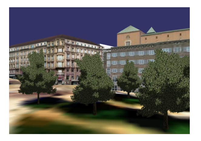
Figure 10. The GISMO client uses SpeedTreeRT to visualise realistic looking trees in real-time.