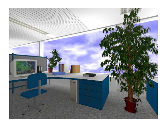
Figure 1. Indoor visualisation showing a workspace at the Institute for Photogrammetry (ifp) rendered in real-time by the Quake 3 Arena game engine.

applications. The rendering performance and quality continuously increases as the game industry develops and implements new visualisation technologies. And many of the last generation engines or game-related libraries are now available for little or even no cost in the form of open-source software. The following sections will focus on both indoor and outdoor visualisation, will introduce some assorted game engines and show prototypical applications that have been built upon them (see e.g. Figure 1). Another aspect will be