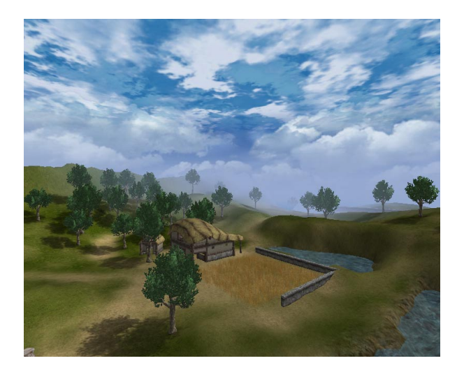
Figure 6. The Unreal Engine 2 is equally suited for indoor and outdoor environments and produces stunning landscape images in real-time.

The Unreal Engine 2 (developed by Epic Games) is one of the most widely used game engines to date. Because it is a cross-platform solution, a broad range of products from PC and video games to architectural visualisations have been already developed with it. Being optimized for both indoor and outdoor environments, it is one of the most modern and versatile engines (see Unreal, 2004). Like most other game engines, the technology is encapsulated in a binary runtime library, while the game related parts of the Unreal games are available as source code in a scripting language called UnrealScript. The novel approach of Epic Games is that they released the Unreal Engine 2 Runtime free for noncommercial and educational use. This means that there is no need to buy the game itself to run modifications and applications that have been developed by the community. The runtime even includes the map editor UnrealEd and header files for C++ programmers. Beginners do find lots of technical documents and even video tutorial that teach level design, script programming and much more.