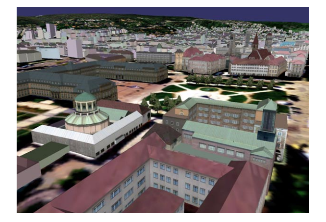
Figure 8. To improve the visual appearance, the façade textures of 500 buildings that are located in the main pedestrian area were captured.