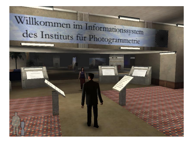
Figure 5. A virtual guide leads the user through the different fields of science in the exhibition room of the information system of the Institute for Photogrammetry (ifp).