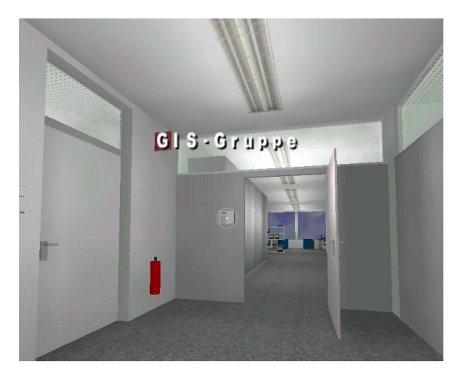
Figure 4. The result of a thematic query shows that this door leads to the room of the GIS group.