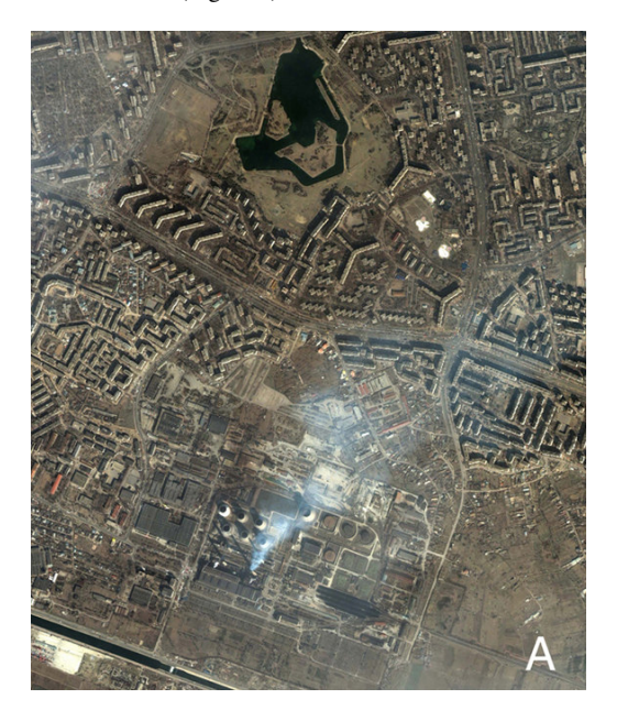
Figure 2. A big residential district is under the influence of air pollution from an industrial zone

identifying air-pollution sources and reporting them to the important constructed areas and green areas by correlating them with the direction and the characteristics of the winds (Figure 2).