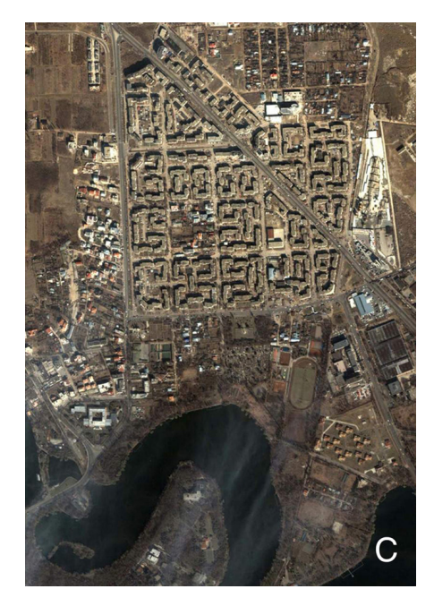
Figure 4. The great density of the residential buildings (over 80%) from Pipera district which is situated in a most favorable ecologic conditions zone (northern part of the city) reduces the urban environment quality in this area.

The quality of the urban environment is also given by the characteristics of man-made elements. Satellite images, even if they are of high resolution and large scale, do not allow the representation and evaluations but of some of these: the density of buildings, the road network.