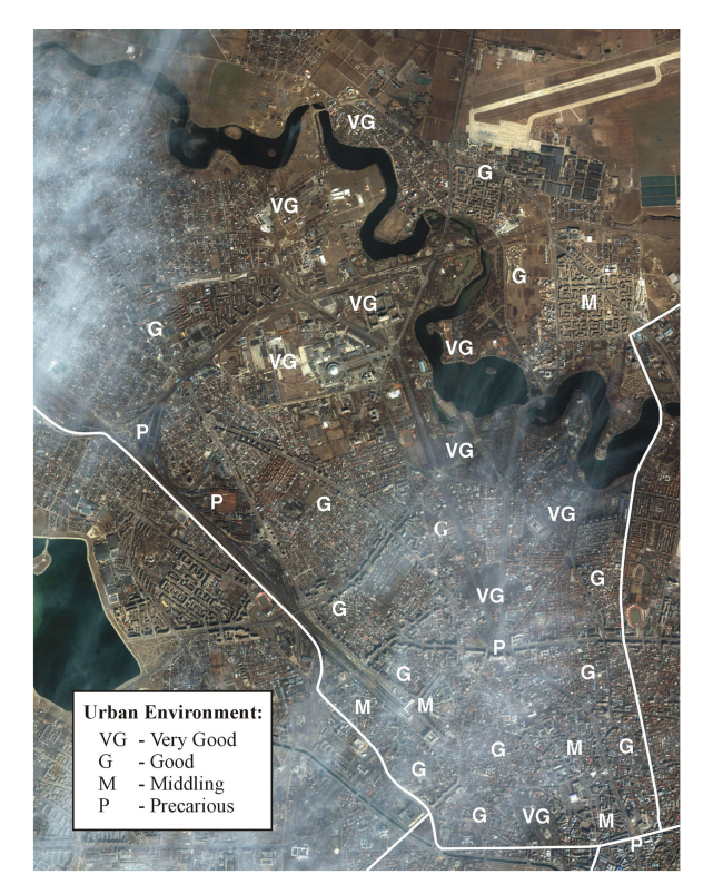
Figure 5. Determination of the environment quality categories in the first sector of Bucharest city based on IKONOS image interpretation

By considering the criteria and by cumulating the parameters estimated through the analysis of IKONOS images it is possible to partially define the environmental quality criteria and to draw the limits between the areas that correspond to them. This opportunity has been demonstrated only for sector 1, Bucharest, an area characterized by a huge diversity of aspects. The urban environment qualitative criteria that were established are: very good (without industrial sources of pollution, with green areas of 35-40 m<sup>2</sup>/ inhabitant, reduced density of buildings: 0-35%), good (with industrial sources of pollution having a reduced impact, air pollution caused by traffic, green areas of 15-20 m<sup>2</sup>/ inhabitant, density of buildings: 35-65%), middling (intense air pollution caused by traffic, green areas 5-10 m<sup>2</sup>/ inhabitant, density of buildings: 65-100%), precarious (very intense pollution generated by the traffic, green areas of less than 5 m^2/ inhabitant, associated or not with the density of buildings of 65-100%).(Figure 5).