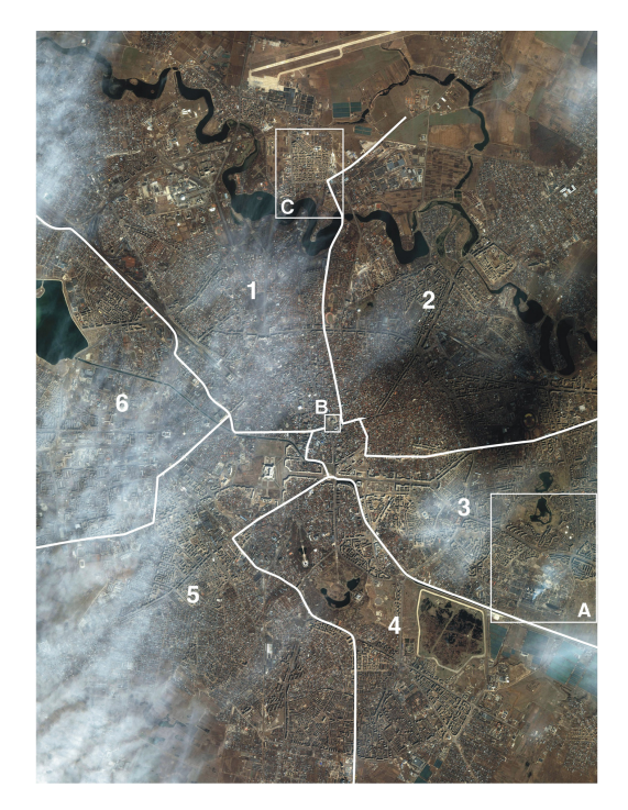
Figure 1. IKONOS image over Bucharest (2001). The administrative limits of the 6 sectors are drawn.

(square meters/ inhabitant), the concentration of constructed areas, the risk of atmospheric pollution. The representation at very large scales of the different components of the city of Bucharest made it possible to achieve detailed analyses and reliable estimations.