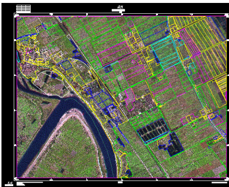
Fig. 2. Updated Land Use Map

In the case that the changed region in T2 data is corresponding to a part of a parcel or corresponding to several parcels in T1 data, the image segmentation method can be used to divide the specific region in T1