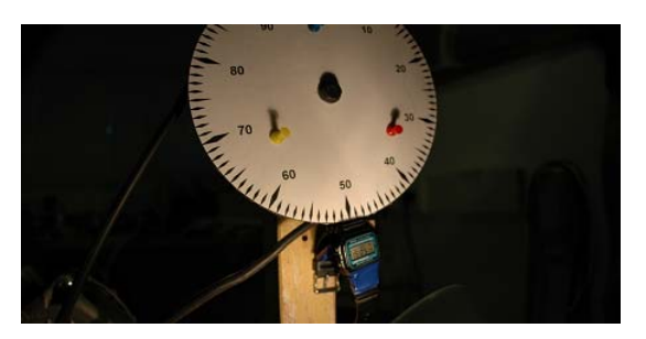
Figure 3. The rolling wheel