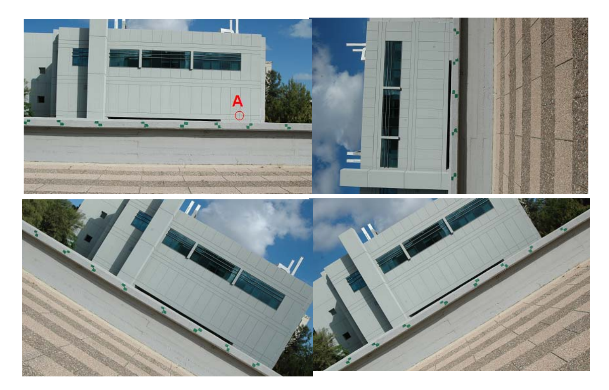
Figure 2. A half of a test field for camera calibration. (The other half is behind)

neighboring buildings standing opposite one other. Some of them are well-defined "natural" points like point A in Fig 3, the others are marked on the walls. The geocentric coordinates of these targets are determined. For single camera calibration we need only two rows. Four photos of these targets are taken as shown in Fig 2. Using the collinearity equations, we find the camera's interior orientation and the polynomial of its radial distortions.