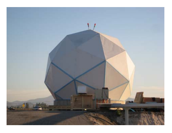
Figure 3 SAF Ground System Antenna

The Ground Station Antenna is installed, in SAF facilities, at the Santiago International Airport. The SAF Ground Station is providing the capacity to receive the data from high resolution satellites, multiespectral and hyperespectral satellites covering Chilean territory. There are separate Command and Data Acquisition area, providing the capability for monitoring and control a commercial satellites constellation. In addition the data are transmitted from the ground station to the SAF Production Area for processing, archiving and further distribution to users. Communication from the Ground Station to the Production Site is via a fibre optic link. The ground station system provides the capability to capture geographical data and process them.