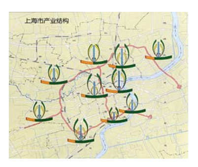
Figure 7. Industry Structure of Shanghai

In thematic map areal color is often light. When broken color is used, it's important to add the gray into the different color, thus the individuality is desalinated and the general character is enhanced, which make the plan seem to be coordinated. Figure 7 In the background the grey is added into the yellow, but the upper thematicl factors' tinting is bright, so the subject is prominent, and the overall color appears gently, it's slow to the visual stimulation and suits the long-time reading. Figure 8 is the Hamburg port development and planning map, in which the old harbor area uses the purple added into the gray, which make persons feel agelong; The new harbor area uses the purity purple to reflect current situation. The whole has formed the time series which looks harmonious.