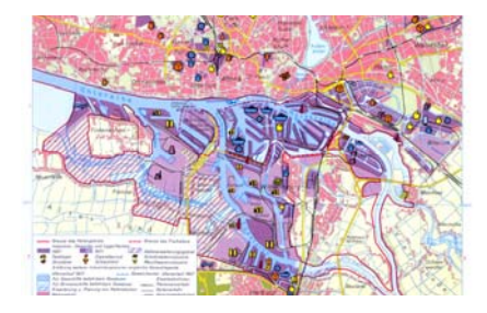
Figure 8. Development and Planning of Hamburg

When the colors contrast intensely, it is often taken to reduce the saturation of several colors or certain color to achieve a harmonious effect. The size and the place of the color block can effect the design. Generally, the low saturation and the weak contrast color is commonly used in the big area, the contrary color is suitable for the small area.