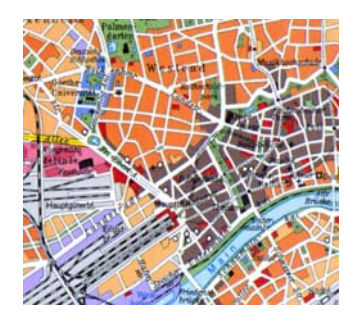
Figure 4. Some City's Map