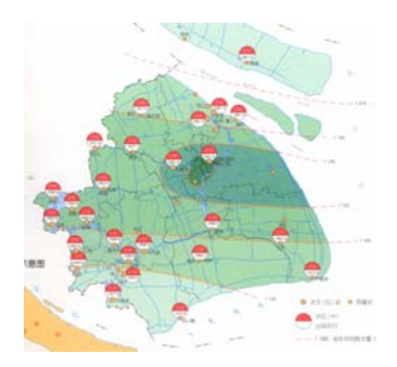
Figure 1. Some place's Hydrology Condition

Generally in the thematic map mapping objects whose color has the explicit color characteristic can be expressed using its similar color, like the green as a basic tone in the forest and vegetation maps. Mapping objects who have no explicit color characteristic should express with the help of the symbolizing of the color. For example the warm tone is used in the high temperature area and the tropics, but the cold color used in the low temperature area and the frigid zone. The gray tone can perform environmental pollution. These tones correctly reflect intrinsic characteristic of various phenomena and conform to the natural characteristic with symbolizing. Like Figure 1 the green tone is used to show some place's hydrology condition, readers can think of clear rivers at a glance. In figue 2 the gray tone is used to show air pollution which covers in the industrial district, which makes the readers feel bad because of what the air pollution takes.