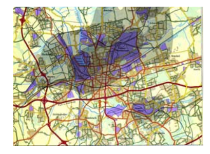
Figure 2. Some place's air pollution

Moreover, the area of mapping factors also restricts its choice of color. According to unit area size of various types, it's necessary to make appropriate readjustment in the brightness