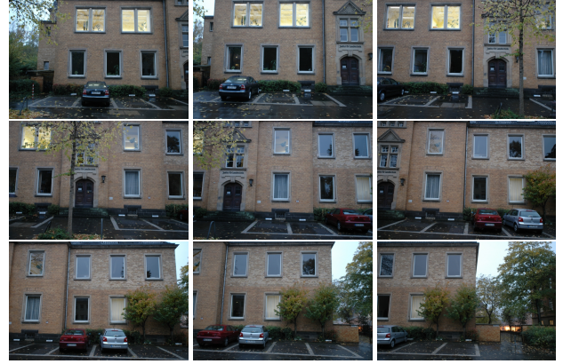
Figure 2: Image sequence used for the experiment

It can be seen that the ratios r_i and 1/r_i of standard deviations are weighted as equally deviating from ratio 1 if we use the logarithm before averaging. The precision level p = 1 is only reached in case the covariance matrices are equal, otherwise p > 1 , e. g. p = 1.05 meaning the standard deviations calculated with \Sigma_2 on average deviate by 5% from those calculated with \Sigma_1 . The formulation compares to the one given in (29) by a factor 2 in the exponent.