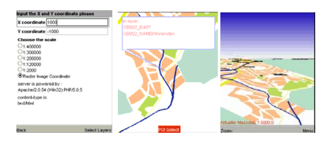
Figure 2: The mobile WMS client provides a graphical user interface; typical functions like zoom and pan are available for exploration of the map obtained from the WMS server.

The client developed has a connection management and provides a user interface derived from the service metadata (cf. Fig. 2). Not only SVGT data, but also PNG data can be displayed from GetMap and GetMap25D requests, and it has the capability to parse most of the GetCapabilities document responded from WMS, which follow the OGC WMS 1.1.1 implementation specification.