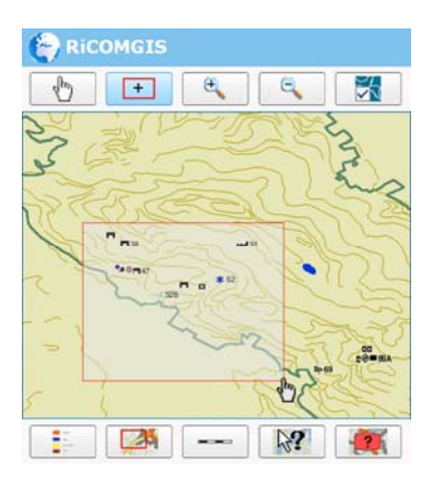
Figure 2. RiCOMGIS Front-End: Zoom by Rectangle.