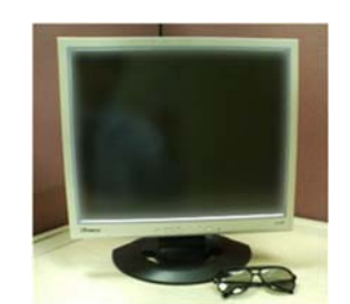
Figure 2. Micro-pol system display

In this system, clients require a display on which we can browse stereoscopic image stereoscopically. A stereoscopic image is generated from two images (James, 1990), left and right images. There are two types as these display. One is micro-pol system, and the other one is parallax barrier system. Figure 2 is a micro-pol system display and Figure 3 is a parallax barrier system display. Micro-pol system forces users to wear polarizing glass, but users can browse stereoscopic image clearly and easily. On the other hand, users can browse image stereoscopically without glass at parallax barrier system. However it is difficult to browse stereoscopic image without experience, and we feel gloomy on this screen.