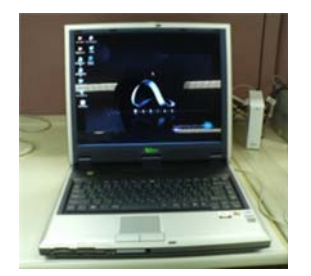
Figure 3. Parallax barrier system display

Stereoscopic image is generated from left and right images which are adjusted to be able to be browsed stereoscopically, and these stereoscopic display require the formats supported by each device. For example, we can browse interlaced format of stereoscopic image stereoscopically. In interlaced format left image lines and right image lines appear alternately, such as odd lines are left image and even lines are right image ( Figure 4 ).