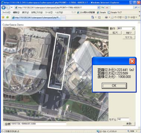
(b) Screenshot of measurement result

Figure 6. Example of stereoscopic image on web browser