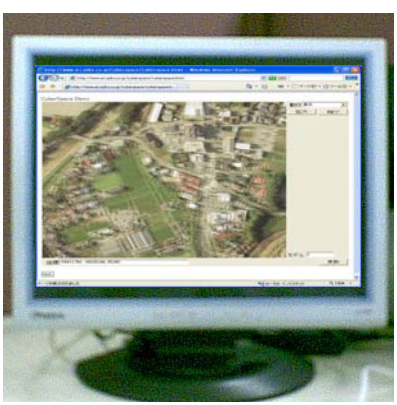
(a) Stereoscopic LCD

http://www.opengeospatial.org/standards/wfs (accessed 10 May 2008)