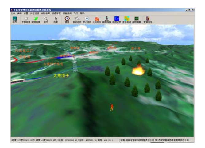
Figure 1. forest fire control commanding and decision making system interface

watchtower, bridge, forestry bureau infrastructure and others, and reveals them with three-dimensional mode.