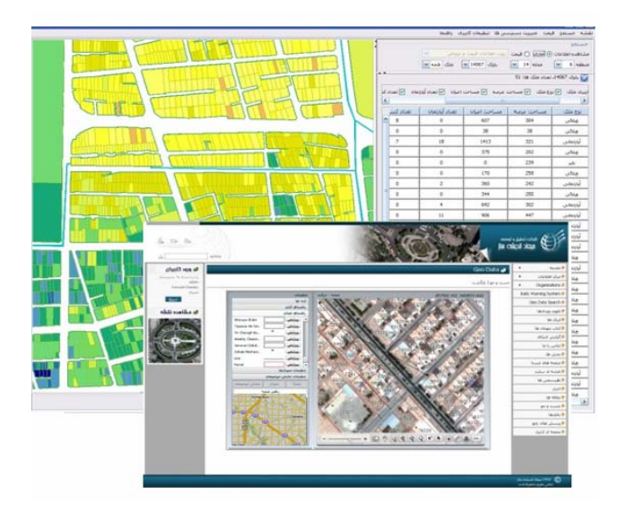
Figure 4. Implemented EGIS samples