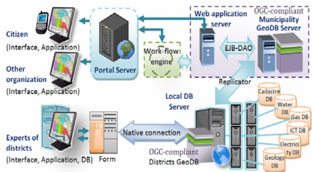
Figure 3. Component of EGIS

The developed SOA Architecture makes allowances for whatever method or technical environment the end user will be using to access different data and services. This flexibility is illustrated in Figure 3 in the showing Portal, Web, and Mobile as the different types of end-user access. Oracle Portal is a framework for building, deploying, and managing enterprise portals as referenced in the top layer of the diagram, Oracle and its business partners are building industry-specific business process solutions that are based on Oracle's SOA platform.