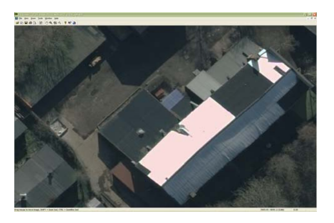
Figur 2: Image found to be oversaturated in parts.

Kort & Matrikelstyrelsen. TOP10DK. Geometrisk registrering. Technical report, National Survey and Cadastre—Denmark, Rentemestervej 8, 2400 København NV, Denmark, maj 2001.