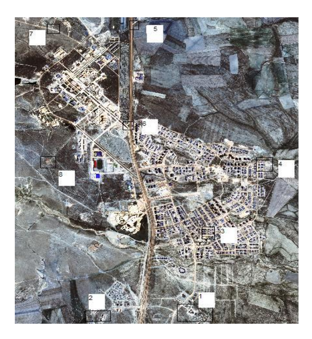
Figure 4. Distribution of the used GCPs on the image.