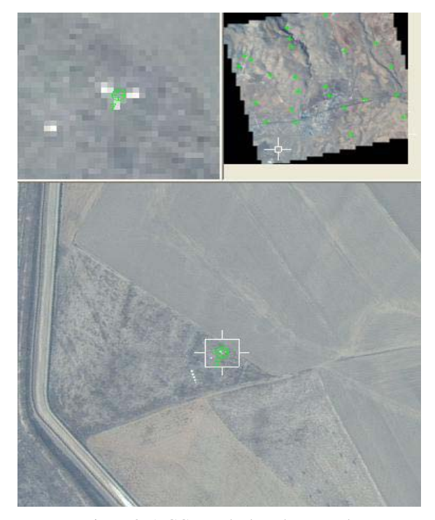
Figure 3. A GCP marked on the ground.

Acquisition of ground control points (GCPs) is particularly important for geometric correction of high resolution satellite images. GCPs are measured with a static GPS receiver (Leica SR 9500 dual frequency) for 30 minutes measurement and postprocessed with a stable GPS point of Turkish National GPS Network (for mono IKONOS imagery 8 GSPs , Stereo IKONOS Imagery 26 GCPs). The accuracy of the measured GCPs is thought to be lower than 0.1m. The processing and adjustment of the GPS observations were made using the SKI Pro software of Leica. The points are marked on the ground as three lines containing one dot in the centre (Figure 3). The marking accuracy of the GCPs is assumed to be 0.5-1.0 m. The distribution of the points is seen in (Figure 4).