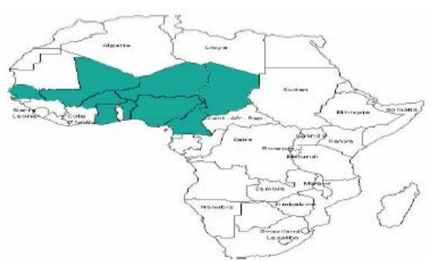
Figure 3. Map of Africa showing the African countries that have benefited from the JEP program at RECTAS

During the research carried out for this paper, graduates from two previous sets (2005 and 2006 graduation) of the JEP program at RECTAS were contacted. Although the response rate was not very high but the following statistics we generated from it. About 75% of the responses indicate that the new skills which they gained from undergoing the training in the JEP have made much difference in their work upon their return to their home organizations. Another phenomenon discovered is that the program has shown training the trainer effect, about 11% of the total graduates within this period are now involved in training in Geoinformation in different African institutions. Also the JEP arrangement makes provision for regular training and retraining of the lecturers who teach in the program at RECTAS. These are trained at ITC and in turn help to maintain the high quality and standard of the training for the JEP. The map of Africa below in Figure 3 indicates the African countries that have benefited from the RECTAS/ITC JEP program at RECTAS. This is indicated as the countries shaded in green colour.