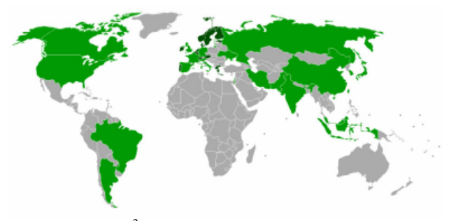
Figure 1: <sup>2</sup> Global Satellite Operating countries

example in Figure1 below: This figure Indicates regional locations where there is adequate capacity to carry out space satellite operations. It is evident that although several satellites have been launched by several African countries the full capacity for the effective operation of these satellites are still located in other regions of the world, primarily the North.