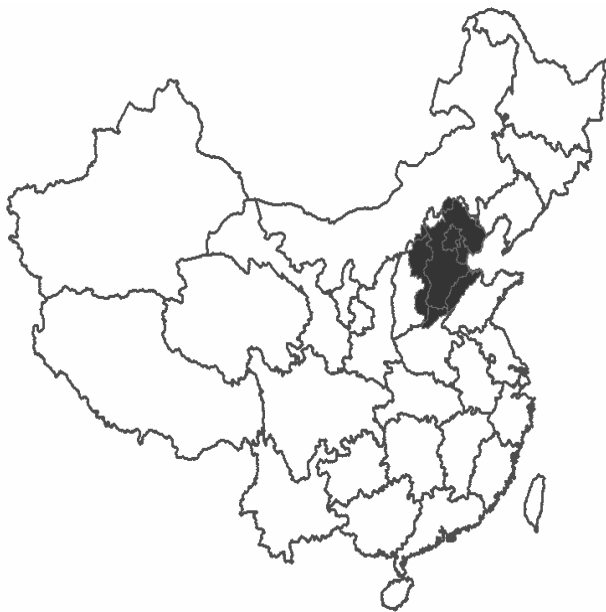
Figure 1. The location of Haihe River Basin in mainland China

Accompanied with significant economic growth in the last decade, HRB experienced a series of great changes in land use and land cover during this period due to intensive human-induced activities, including intensive exploitation of land resources. So the matter of evaluating the eco-environment and keeping sound circles in HRB is crucial in order to achieve the sustainable development of basin's society and economy.