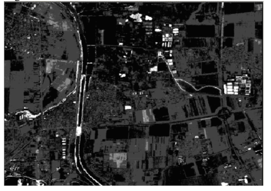
Figure 2. The result of image ratio method.

The computing principles of image ratio method is similar to the mage subtraction method, the result is: