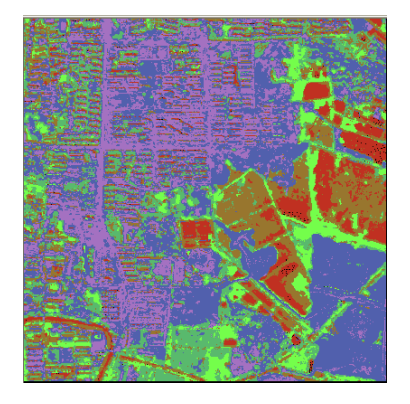
Figure4 rough land classification map