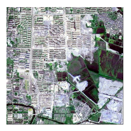
Figure 2 original image.

SPOT image of South Lake in Wuhan City in 2005 is select as the Experimental zones. The image's resolution is 2.5 m for it had been integrated. Experimental areas is located at: longitude 114 \circ 18'11.18 "-- 114 \circ 19'26.39 ", latitude: 30 \circ 29'41.79 "-- 30 \circ 30'46.55 ". This region is at the southwest of Wuhan city, the location of it is remoteness from urban centre. According to the latest land-use classification standards and its own interpretation characteristics of remote sensing image, the type of land in this area can be divided into: (1) farmland (including paddy and vegetables ) (2) water (including lakes, ponds and ditches) (3) transport land (including road and airport sites) (4) construction land (including to use, mining warehouse space, land for residential development, public administration and public services Space) (5) grass (6) other land (here mainly refers to idle and bare land). The original imag as Figure 2.