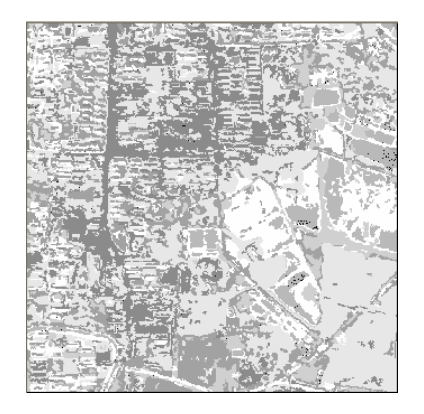
Figure 5 the land classification map by the cooperative interpretation

To do the registration between the rough land classification map which is got though the supervised method and the vector data. On the basis of this kick out of spot without regional characteristics, so as to improve the accuracy of interpretation.After doing the cooperative interpretation, the land classification map as Figure 5: