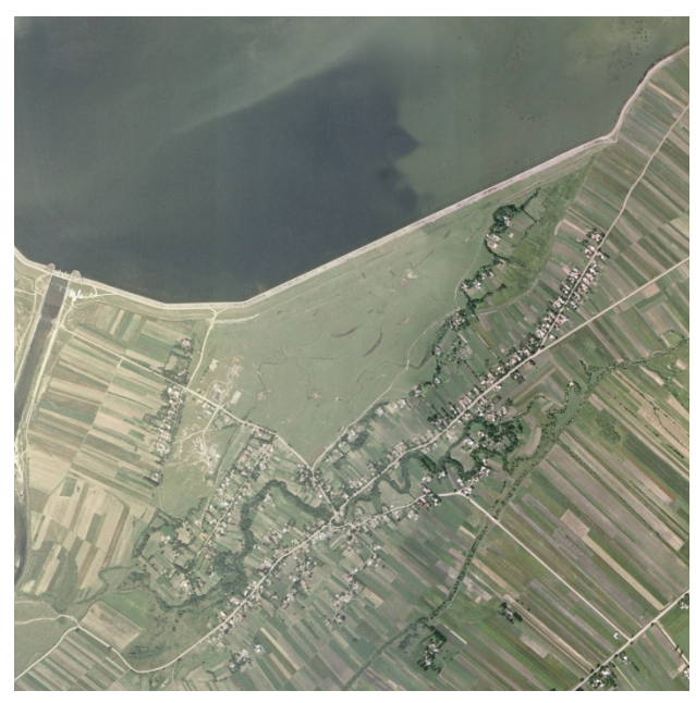
Figure 3 a and b. Present the ortophoto for the Siret river basin. (Botosani area)