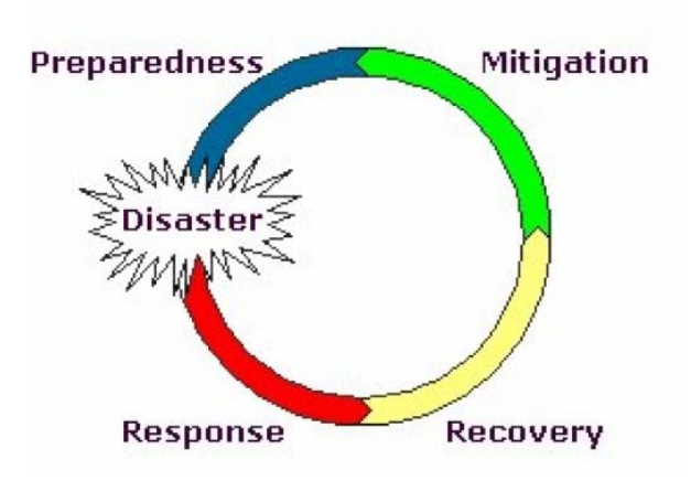
Figure 1. Disaster management

to victims of disaster, and achieve rapid and effective recovery. It also provides coordination of all public institutions and sources and applicability for the common purpose (Sengezer, 2001). Mitigation, preparedness, response, recovery are the phases of a disaster management (Figure 1).