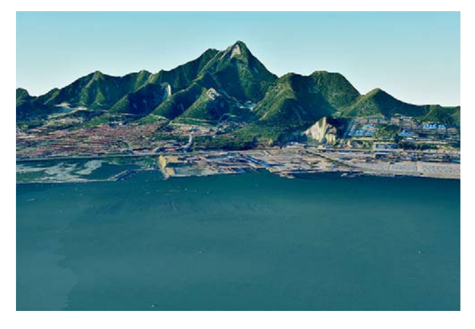
Figure 3. 3D terrain model of coastal zone and island

Build 3D terrain model of coastal zone and island quickly. Digital Coast (DC) requires that building high-precision, true three-dimension, measurable, third-dimension and coastal 3D terrain model should be regarded as virtual platform which is applied to manage coast. However there are heavy workload, low efficiency and no good effects and width and depth that digital coast serves are influenced, when traditional technique is applied in coastal 3D modeling. Coordinates of high-density and high-precision 3D points can quickly be acquired by airborne LIDAR, and big-area 3D coastal model can conveniently be built when point cloud data is used to build model and texture mapping. Furthermore quick dynamic update can be put into effect and true guarantee can be provided for endurance and history of basic data source which is used to build digital coast. See figure 3.