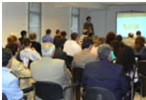
A Technical Session

The group meeting of ISPRS Commission VII, WG 7 & 2 was carried out for 2 and a half days with scientific exchange of the ideas.