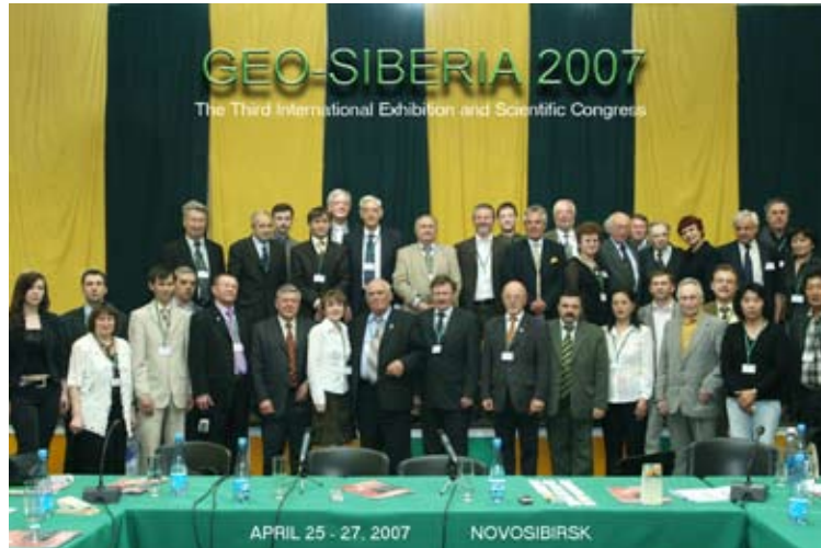
The participants in the round table discussion of international cooperation with SSGA

commercial organizations involved in the spatial information industry