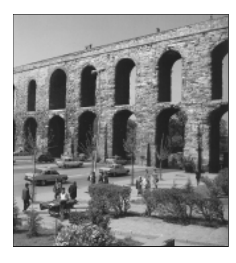
Aqueduct of Valens.

The cultural impact of Byzantium, though not as forceful as the Greek and Roman heritage, did in fact leave behind its imprint in Anatolia, thus adding to the rich and varied cultural mosaic of the region.