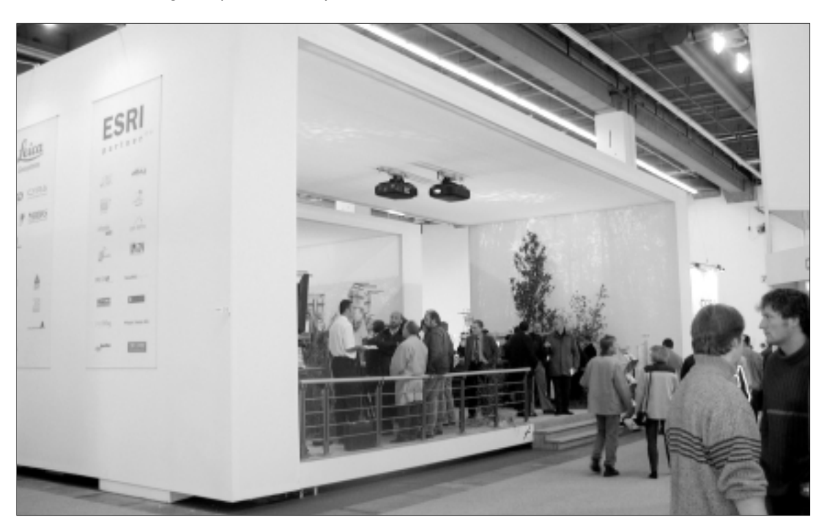
Leica Geosystems and ESRI share in brotherly fashion a hall within a hall, separated from the rest of the floor by huge linen partitions.

An on-going tendency is the attempt on the part of leading firms to cover the entire horizontal spectrum of the geomatics field by establishing partnerships. The vitality of this movement was clearly demonstrated by Leica Geosystems and ESRI, who in a brotherly fashion shared the same compartment — a hall within a hall — separated from the rest of the floor by huge linen partitions. Inside the stand, the linen served as movie screens onto which outdoor scenes were projected. By means of sand, trees, shrubs and raw wooden tables the effect was created of