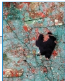
COVER: Image of Hyderabad, as viewed by the Indian Remote Sensing Satellite-1D. It is a merged product generated using LISS-3 (23 m multi spectral image) and Pan (5,8 m) data. The date of pass for which the PAN sharpened LISS was generated is 60 30/03/2001 (PAN) & 15/03/2001 (LISS-III). The PATH is 100 and ROW is 60. Satellite is IRS-1D.