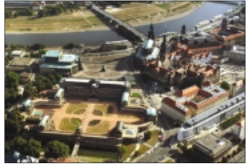
Dresden aerial view.

While Commission V activities were formerly mainly focused on applications such as cultural heritage recording and documentation, many promising new application fields are found in industrial design, production and quality control processes. Sophisticated image engineering approaches were developed to support the reliability of image analysis procedures and to achieve success rates beyond 99.9% in fully automatic multi-ocular photogrammetric 3D measurement systems. Active systems based on cameras combined with projection techniques allow for 3D surface measurements at data rates beyond one million points per second.