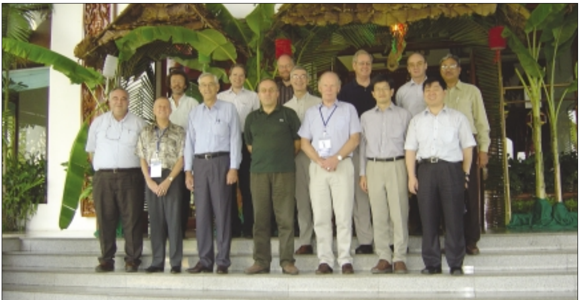
Meeting of the Council and TCPs in Chiang Mai.