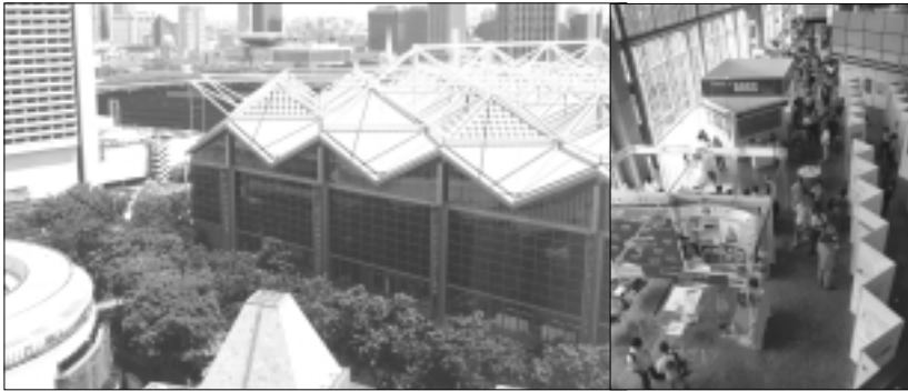
Suntec Conference Center (left), and coffee/poster area of the AOGS meeting.

Japanese spacecraft Selene, to be launched in 2007, will carry several cameras, spectrometers, radar, as well as a laser altimeter for comprehensive high-resolution topographic mapping of the Lunar surface.