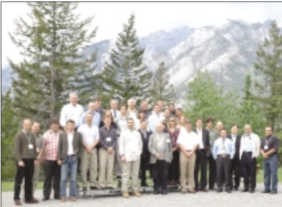
The Banff Centre, in the heart of the Canadian Rockies provided an excellent venue for the workshop. Continuing a tradition extending back to Cambridge (Comm II, 1998) a jazz trio contributed to the 'bon ami' of the workshop dinner.