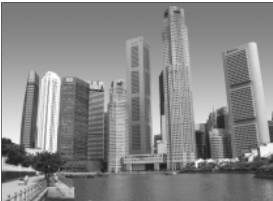
Skyline of Singapore, in June 2005.

Another focus of the meeting was on Lunar science. The technology-demonstration mission Smart-I was launched by the ESA (European Space Agency) last year, has successfully entered Lunar orbit, and is currently carrying out an observation campaign. Other space agencies worldwide are currently preparing missions to the Moon, among them the US, Japan, India, and China. The large