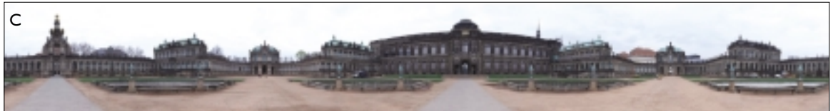
Dresden panoramic image.

Photogrammetry delivers many contributions to the development of virtual reality products, with applications fields ranging from cultural heritage to animation and movie production. In addition to the generation of high quality textured 3D object models, multi-ocular image sequence processing introduces the 4th dimension, allowing for manifold applications in 3D motion analysis. Image sequence analysis and sensor fusion also play a major role in the development of mobile mapping systems and in