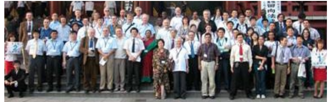
Group photo taken at the Sensoji Temple, Asakusa on June 29, 2006.