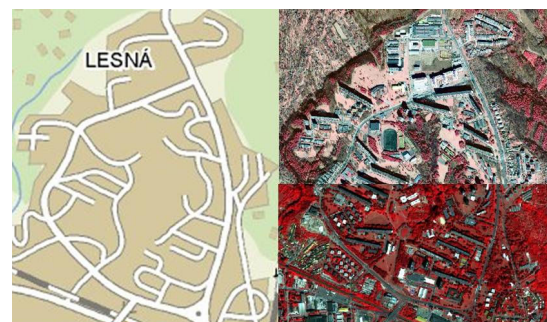
Figure 2. Area of interest. Upper-right: Ikonos (4,3,2 composition), lower-right: QuickBird (4,3,2 composition)