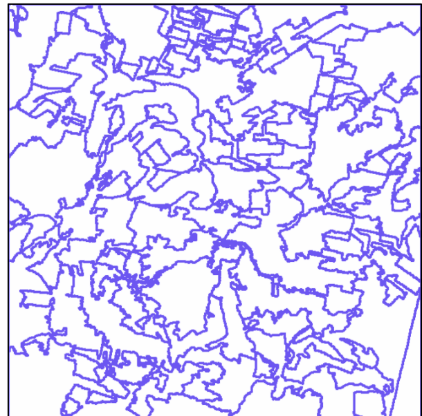
Figure 3. The segmented satellite image with scale=85