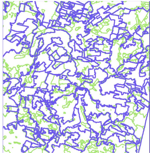
Figure 5. The segmented satellite image with B_C=18.5 and scale=85

On the Fig. 5 (see below) the output produced by both methods discussed above is shown – green is used for morphological segmentation and blue for this done by eCognition package. Although the number of regions is very close (230 and 208, respectively) most of the areas corresponding to vegetation (mostly for the grain crops) do not coincide, but for other land cover types such as water, urban parts the areas overlap. This might be product of the different approach implemented by these two methods. For the morphological method it is certain that it uses only the brightness values, but we are not aware what is considered by the segmentation in the eCognition package.