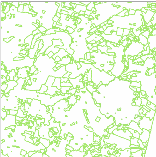
Figure 4. The segmented satellite image with B_C=18.5

On the Fig. 5 (see below) the output produced by both methods discussed above is shown – green is used for morphological segmentation and blue for this done by eCognition package. Although the number of regions is very close (230 and 208, respectively) most of the areas corresponding to vegetation (mostly for the grain crops) do not coincide, but for other land cover types such as water, urban parts the areas overlap. This might be product of the different approach implemented by these two methods. For the morphological method it is certain that it uses only the brightness values, but we are not aware what is considered by the segmentation in the eCognition package.