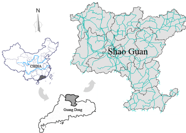
Fig.2 Study area(Shaoguan city in Guangdong province. China)

Using TM images supervised classification method, the Shaoguan land use in 1996 and 2004 are classified, and the change of each objects are got form the different period classification map. The Shaoguan land use classification map in 1996 and 2004 are as Fig.3 and Fig.4.