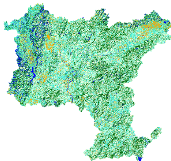
Fig.3 Shaoguan land use classification map in 1996

Sindex = {soil pollution, irrigation potential, landform, slope, thickness of soil layer, vegetation index, population density,