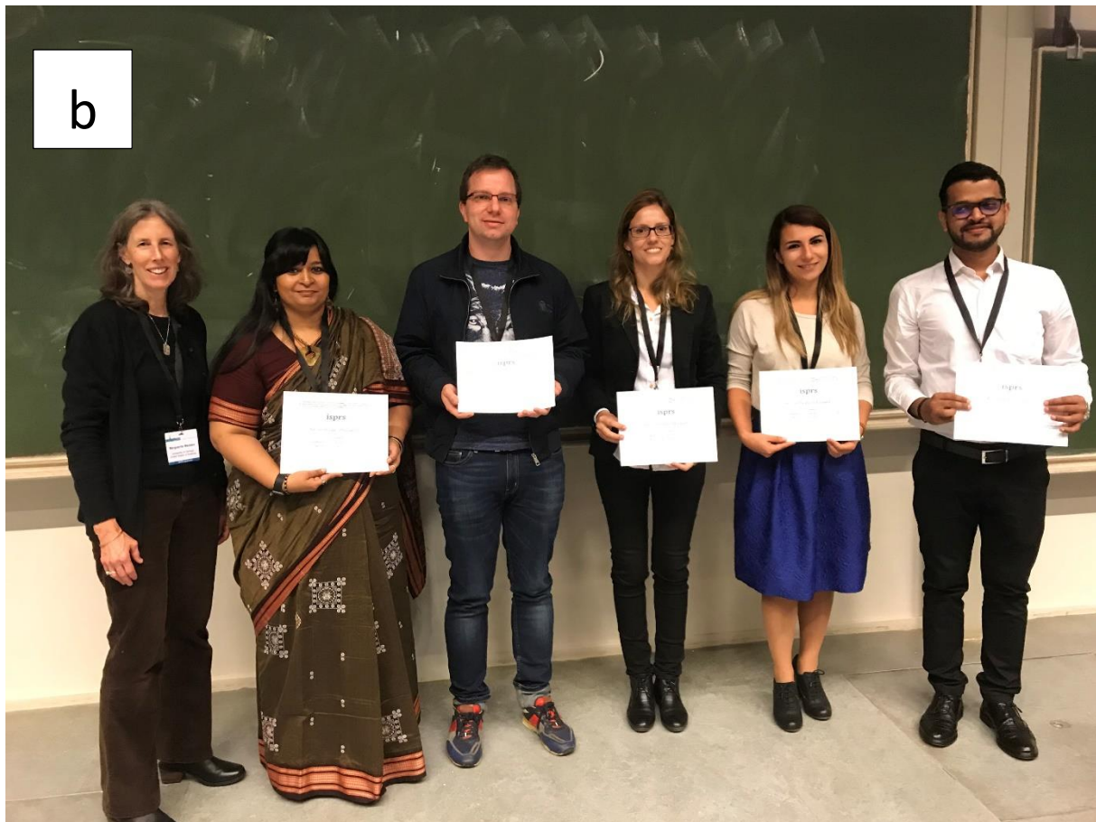
Figure 1. TIF Travel Grant recipients at the: a) Technical Commission I Symposium held in 2018 in Karlsruhe, Germany; and b) Technical Commission IV Symposium held in 2018 in Delft, The Netherlands.